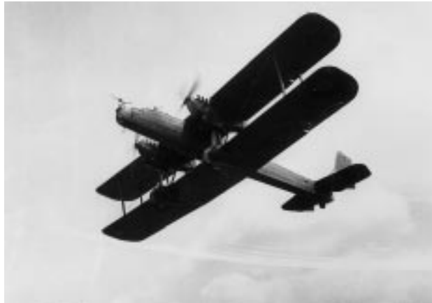
FIG. 2 The RAF Heyford bomber of the type that was the first radar target in England in February 1935 (with acknowledgement to The Trustees of the Imperial War Museum).

of radar and remote sensing and with them a whole host of new electronic technologies.